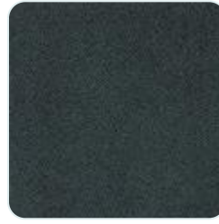
Black caviar look